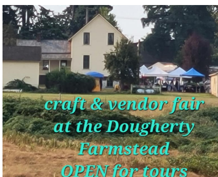
Vendor Fair Hosted by DHS