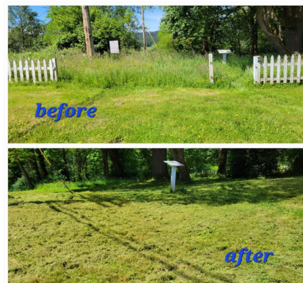
Maintaining Historic Landscapes