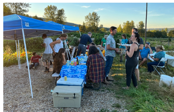
Presentation Dougherty Farmland History to Sno Valley Tilth