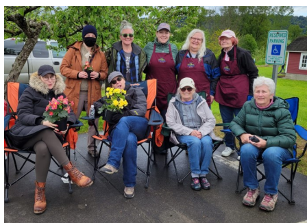
DHS Hosting Civic Club's Plant Sale