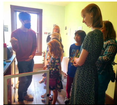
Homeschooling Private Tour