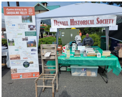
Duvall Days has a Historical Society Booth