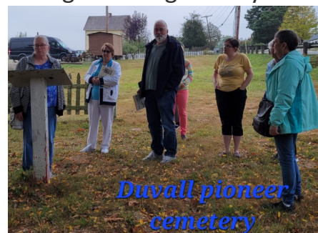
Sno Valley Senior Center Tour