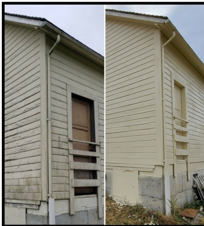
Left: DHS VP Fiver Pilon and Scout Zach from Troop 909