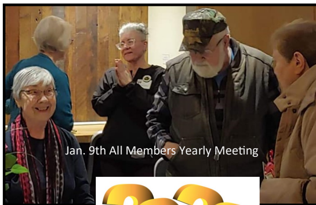
Jan. 9th All Members Yearly Meeting