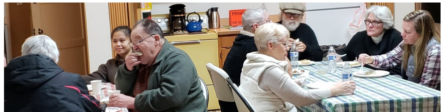
Annual members Meeting