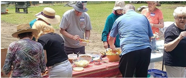
Cherry Valley Elementary Picnic