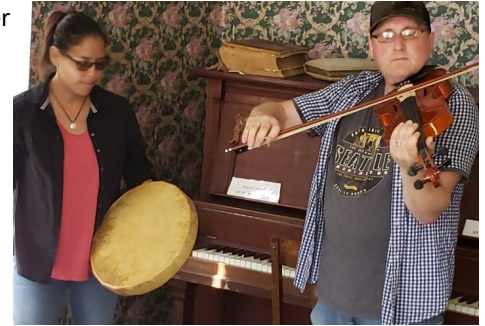
Haunted Walking Tour