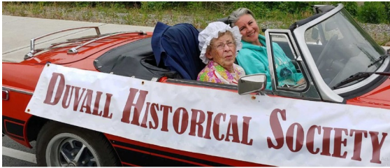
Duval Days Parade