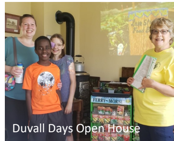
Duvall Days Open House