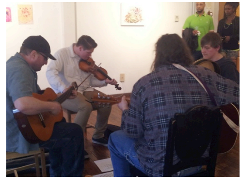
The artist (left) and family performing at a recent Seattle arts event